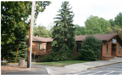
Hawk's Reach Activity Center. The start and finish location are at the telephone pole in this photo.

NOTE: The starting point of the course is in the Little Bennett Campground. During the camping season, April 1 - October 31, or weekends in the off-season, park off of Route 355 and hike in to the Hawk's Reach Activity Center. If you're camping here, or weekdays during the off-season, you may park at Hawk's Reach Activity Center. For further explanation, please call 301-528-3430.